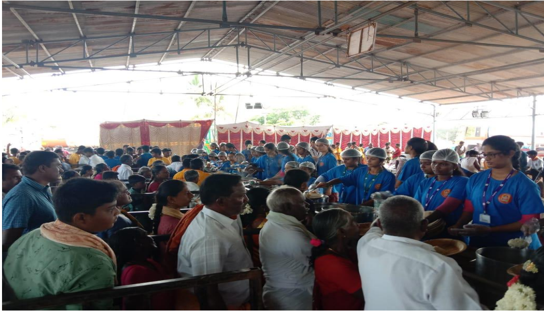
Our Volunteers providing volunteer ship for Atthanoor Amman Kovil Kumbhasheikam (11.09.2022 to 12.09.2022)

Paavai Engineering College, NSS Volunteers food served for more than 1 lakh people along with 500 volunteers at Atthanoor Amman Kovil Kumbhasheikam, Salem on 12.09.22. We also food served for more than 20000 people on 11.09.22 at Atthanoor Amman Kovil along with 300 volunteers.