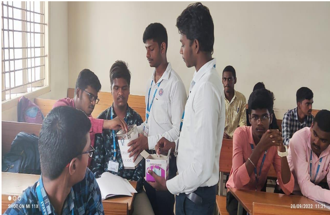
Our NSS Volunteers collecting Fund from our college Students (20.09.2022)