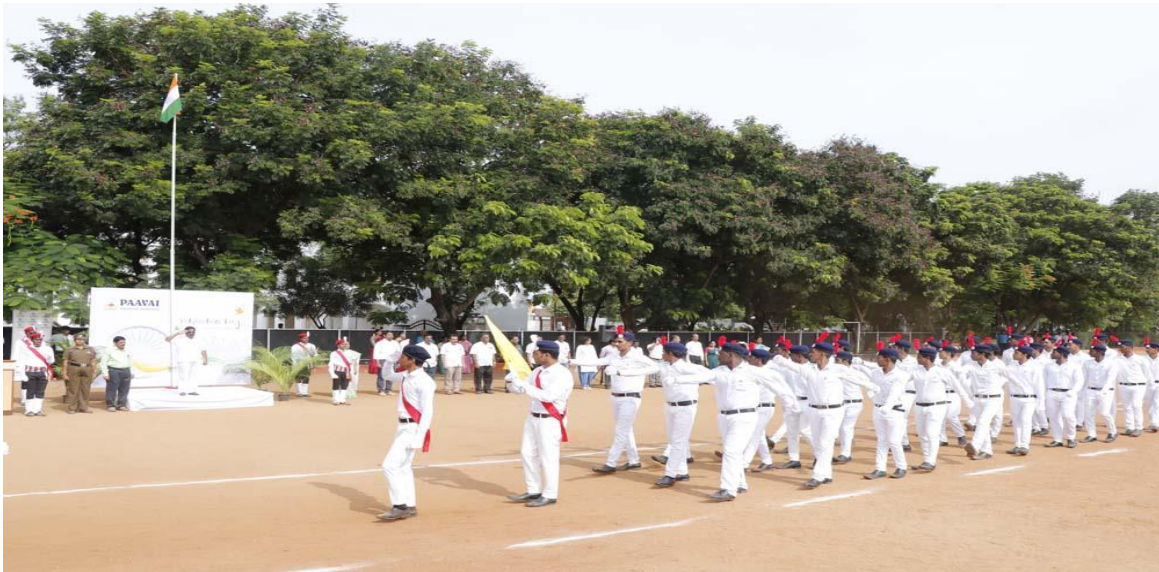
Our NSS volunteers participating in the march past in the Independence Day Celebration (15.08.2022)

We celebrated our Independence Day on 15 th August, 2022. Our NSS volunteers more than 150 students willingly participated in the march past. At the end of the programme, Independence oath was taken by our students. The NSS Volunteers and Blood donors honored with the Certificates.