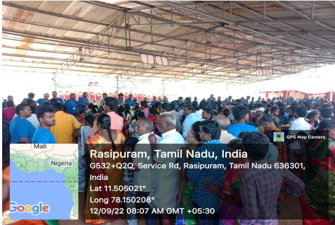
Our Volunteers providing volunteer ship for Atthanoor Amman Kovil Kumbhasheikam (11.09.2022 to 12.09.2022)