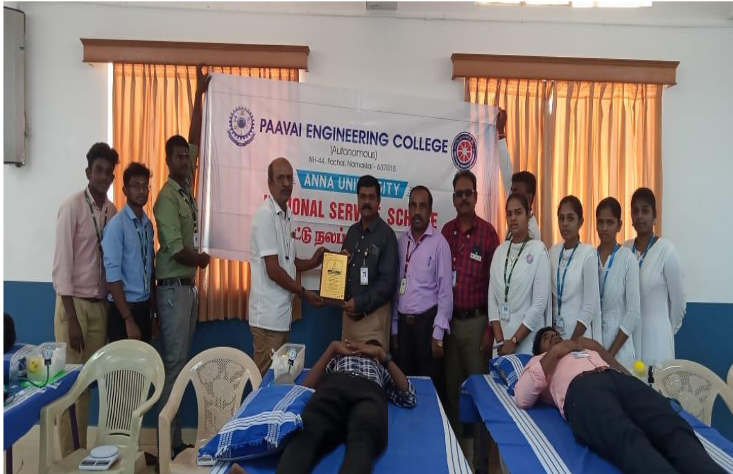
Our Volunteers and Students Donating their Blood (17.02.2023)