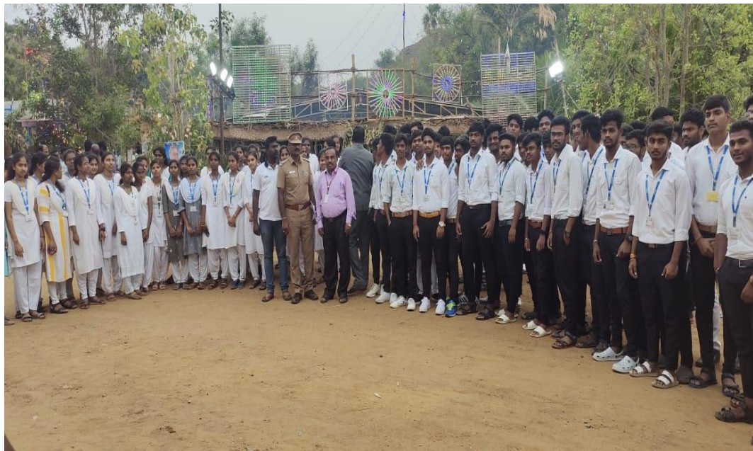
Our Volunteers providing volunteer ship for Surya Linkeswarar Kovil Kumbhasheikam (27.03.2023)