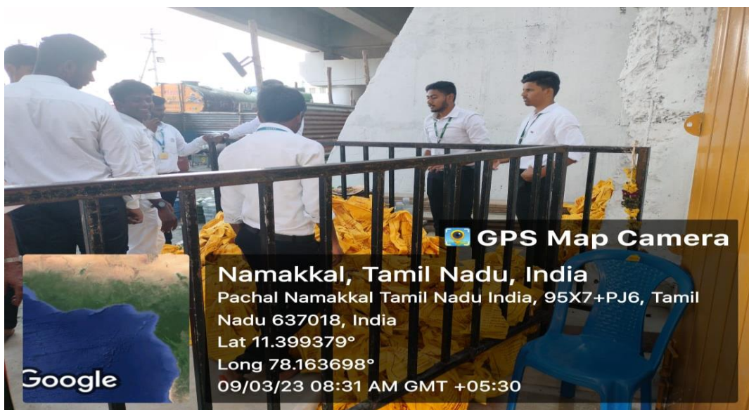
Our Volunteers providing volunteer ship for Rasipuram Kaliamman Kovil Kumbhasheikam (09.03.2023)