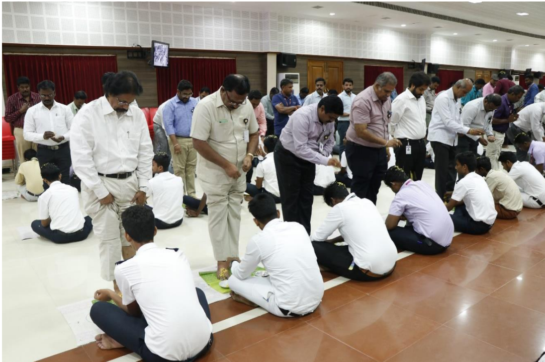
Our students doing Patha Pooja for Teachers (05.09.2022)