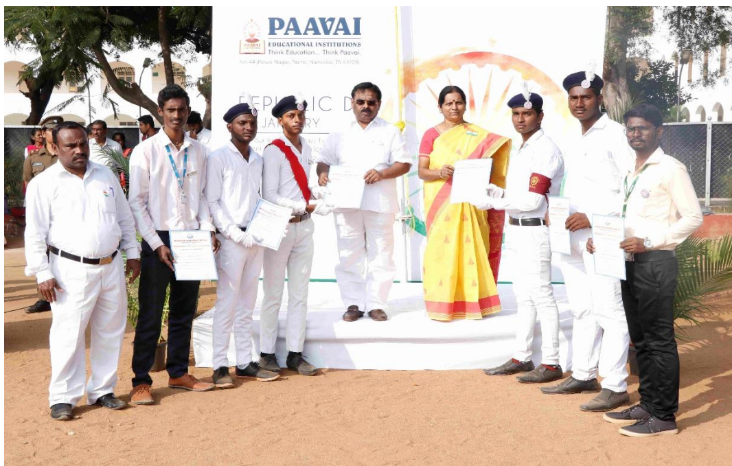
Our NSS volunteers receiving Award and Appreciation certificates in Republic Day Celebration (26.01.2023)