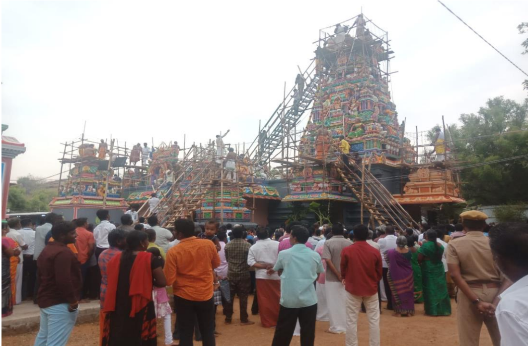
Our Volunteers providing volunteer ship for Surya Linkeswarar Kovil Kumbhasheikam (27.03.2023)