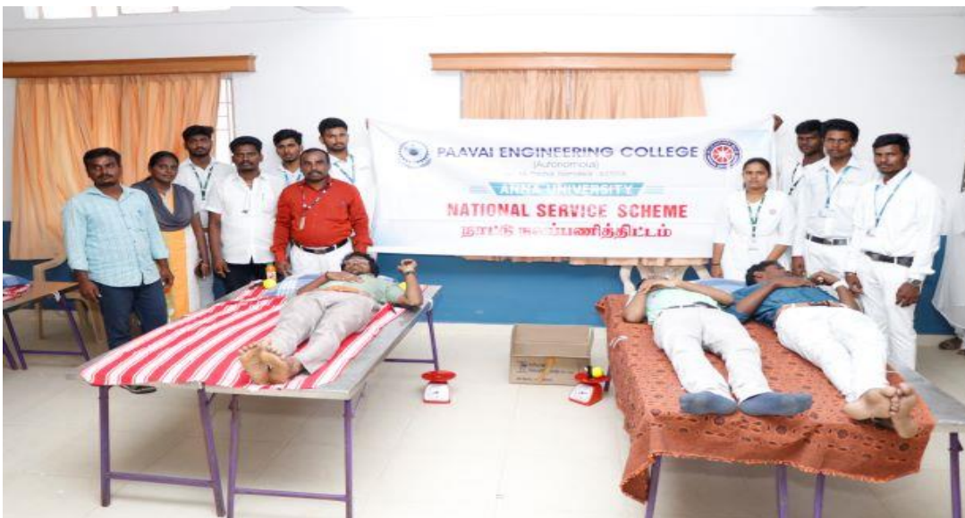
Our Volunteers and Students Donating their Blood (22.09.2022)