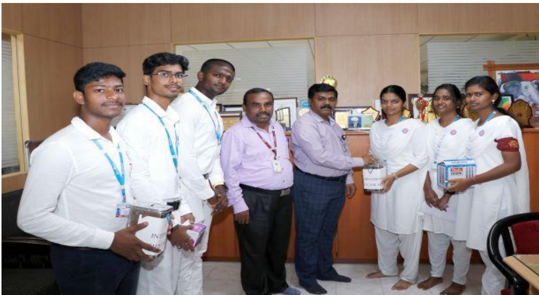
Our NSS Volunteers collecting Fund from our college Staff Members (20.09.2022)