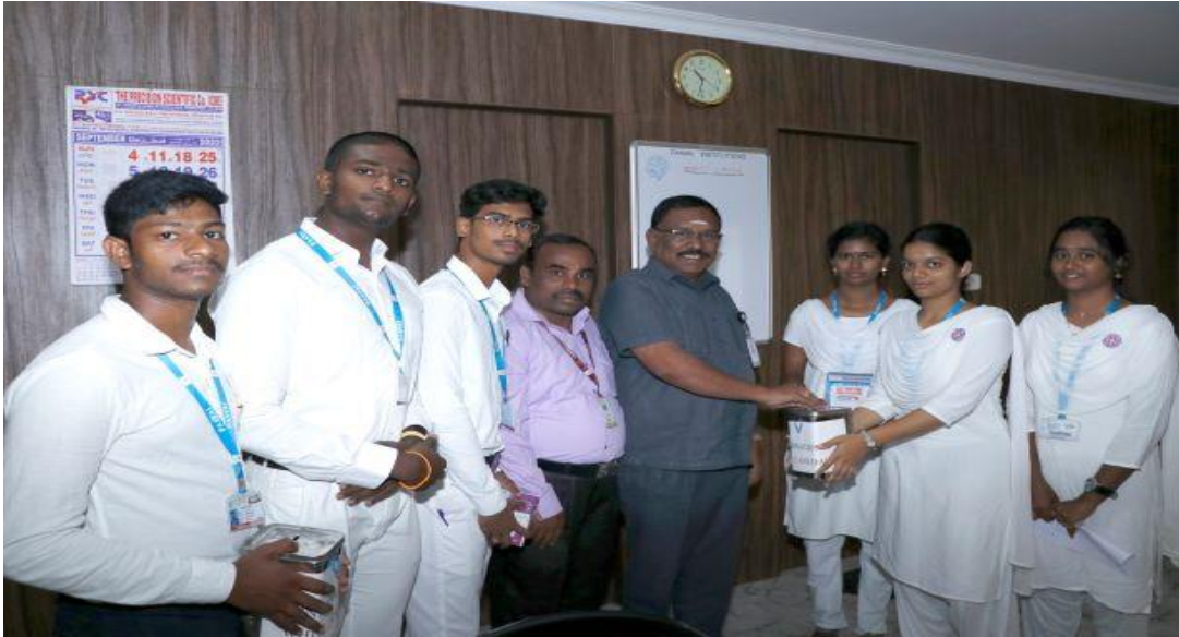
Our NSS Volunteers collecting Fund from our college Staff Members (20.09.2022)

Indian Association for the Blind, Madurai is celebrating the International White Cane Day for the Blind. In this connection all students and staff members were contributed the amount for the visually challenged children on 20.09.2022 (Tuesday) and the total amount is Rs.18625.00. The donated amount was sent to the “Indian Association for the Blind, Madurai-625104” and All the Children Orphanage, Chennai for visually challenged and orphanage children education purpose.