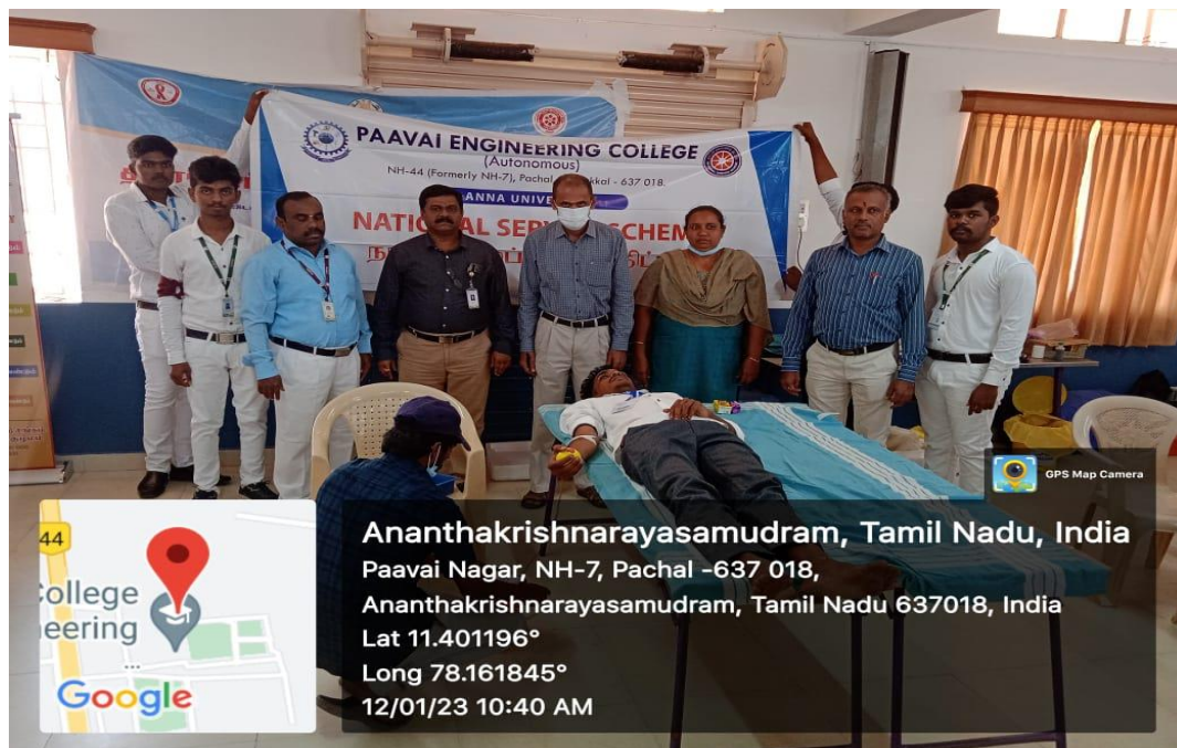
Our Volunteers and Students Donating their Blood (12.01.2023)