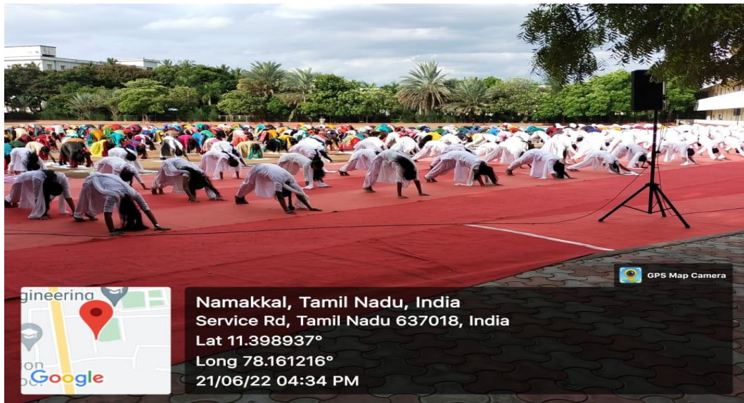
Students performing the fundamental Asanas in Yoga (21.06.2022)

Activity Name: International Yoga Day Awareness and Celebration Date: 21.06.2022