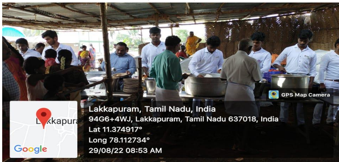
Our Volunteers providing volunteer ship for Lakapuram Mari Amman Kovil Kumbhabhishekam (29.08.2022)