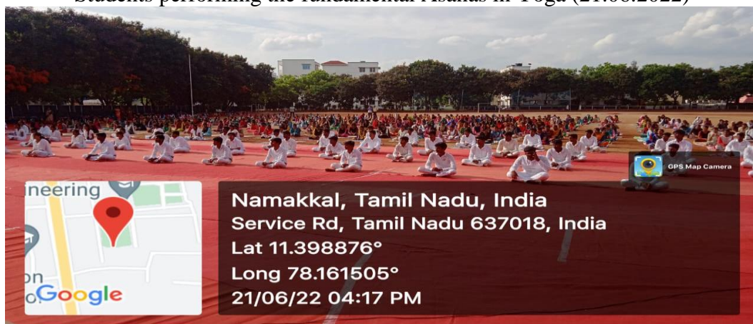
Students performing the fundamental Asanas in Yoga (21.06.2022)