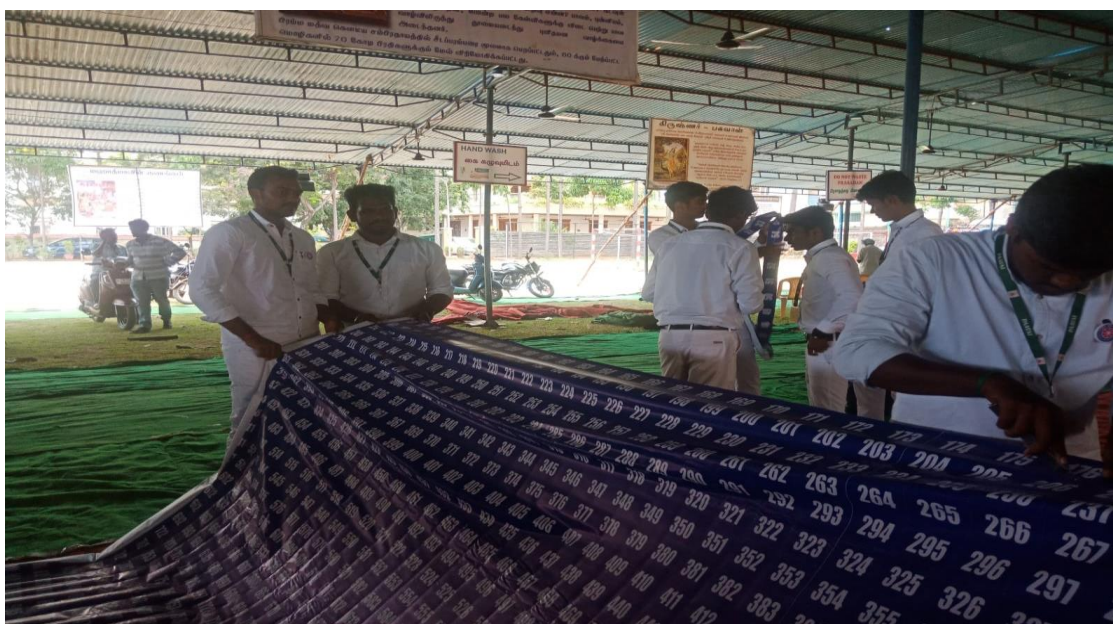
Our Volunteers providing volunteer ship for Janmasthanmi at ISKCON, Salem (18.08.2022)