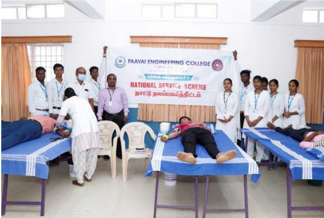
Our Volunteers and Students Donating their Blood (17.02.2023)