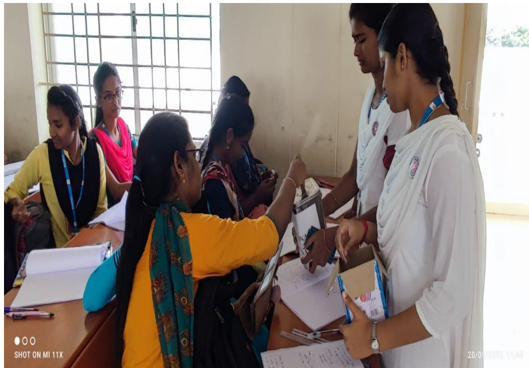
Our NSS Volunteers collecting Fund from our college Students (20.09.2022)