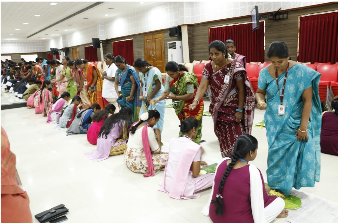
Our students doing Patha Pooja for Teachers (05.09.2022)