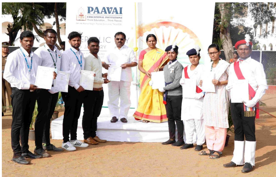
Our NSS volunteers receiving Award and Appreciation certificates in Republic Day Celebration (26.01.2023)