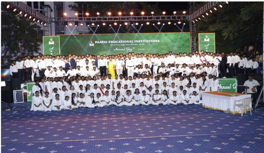
Annual Day Celebration NSS Volunteers Group photo (11.03.2023)