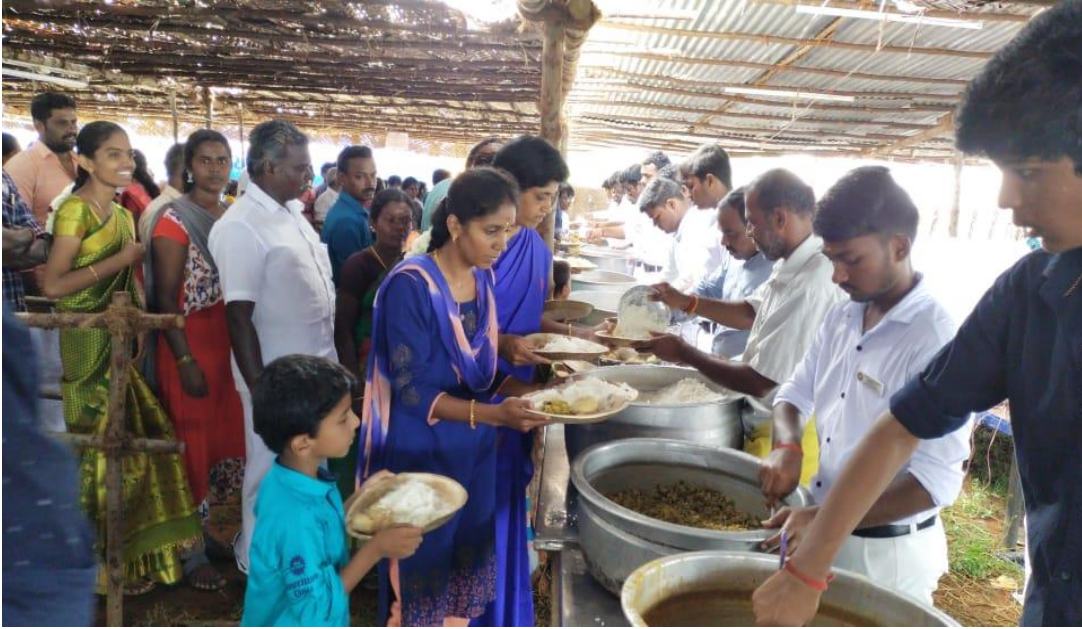
Our Volunteers providing volunteer ship for Lakapuram Mari Amman Kovil Kumbhabhishekam (29.08.2022)

Activity Name: Lakapuram Mari Amman Kovil Kumbhabhishekam Volunteer ship Date: 29.08.2022