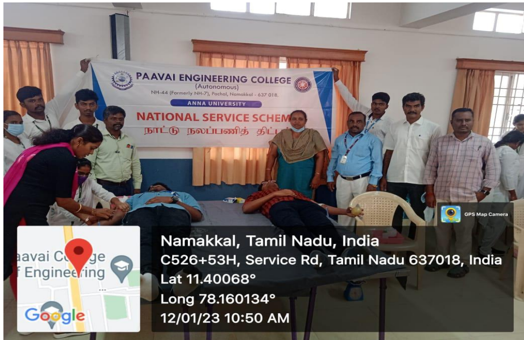
Our Volunteers and Students Donating their Blood (12.01.2023)