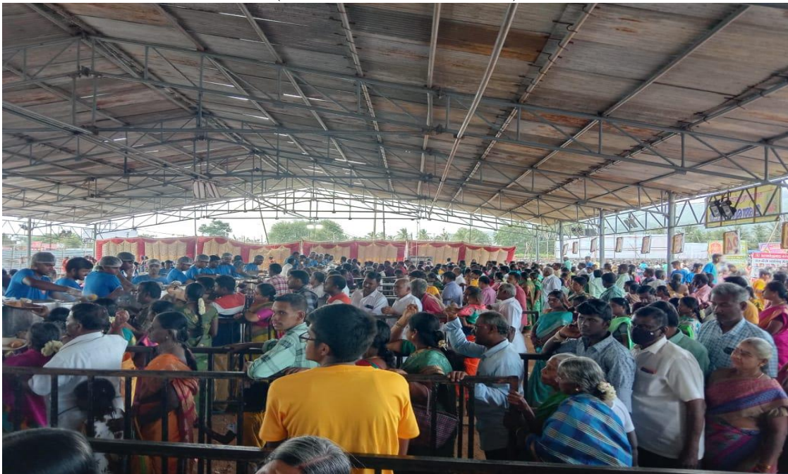
Our Volunteers providing volunteer ship for Atthanoor Amman Kovil Kumbhasheikam (11.09.2022 to 12.09.2022)