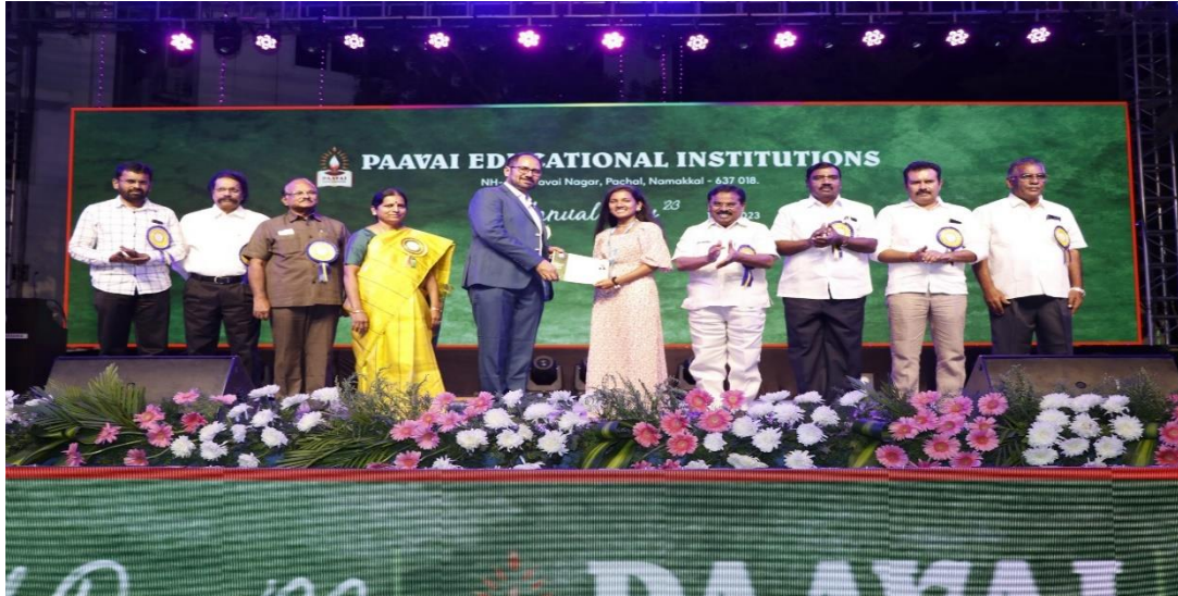
Annual Day Celebration-Prize Distribution (11.03.2023)