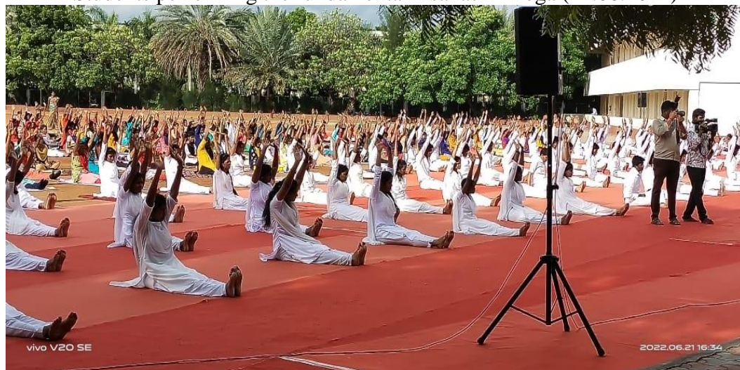
Students performing the fundamental Asanas in Yoga (21.06.2022)