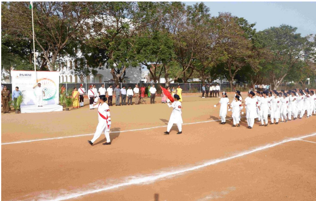
Our students participating in the march past in the Republic Day Celebration (26.01.2023)