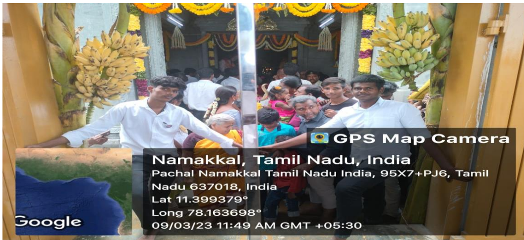
Our Volunteers providing volunteer ship for Rasipuram Kaliamman Kovil Kumbhasheikam (09.03.2023)

Paavai Engineering College NSS Volunteers helped and supported in the Rasipuram Kaliamman Kovil Kumbhasheikam on 09.03.2023 (Thursday). Our students involved in making the arrangements and crowd control to visiting the temple. In this activity 20 volunteers were participated.