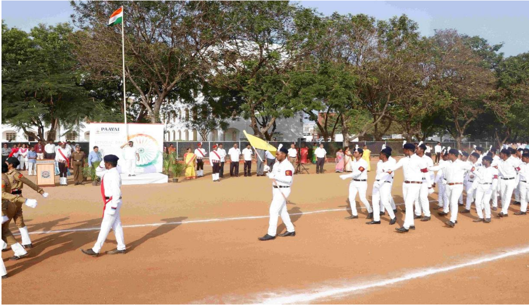
Our students participating in the march past in the Republic Day Celebration (26.01.2023)

We celebrated our Republic Day on 26 th January, 2023. Our NSS volunteers more than 150 students willingly participated in the march past. At the end of the programme, Republic Day oath was taken by our students. The NSS Volunteers and Blood donors honored with the Certificates.