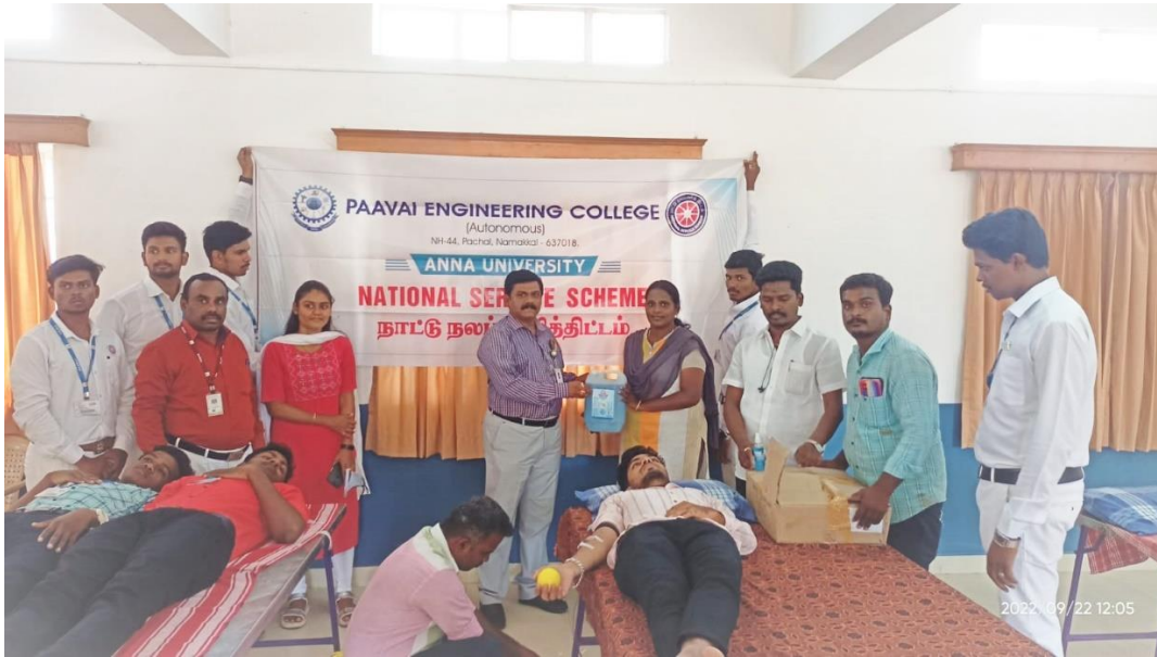
Our Volunteers and Students Donating their Blood (22.09.2022)