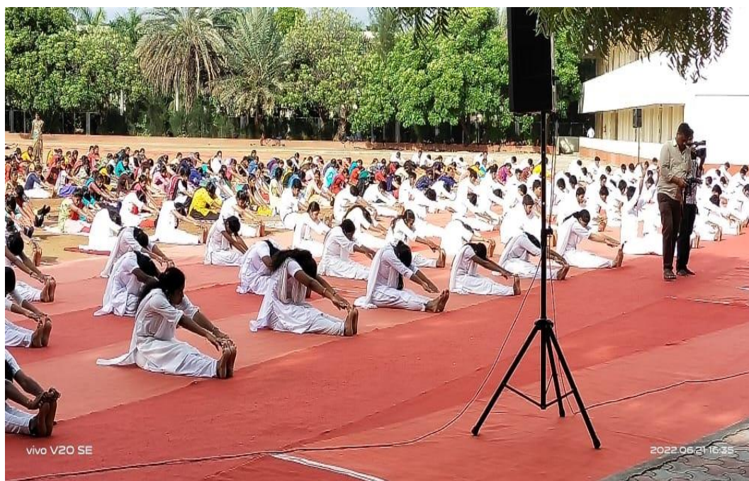
Students performing the fundamental Asanas in Yoga (21.06.22)