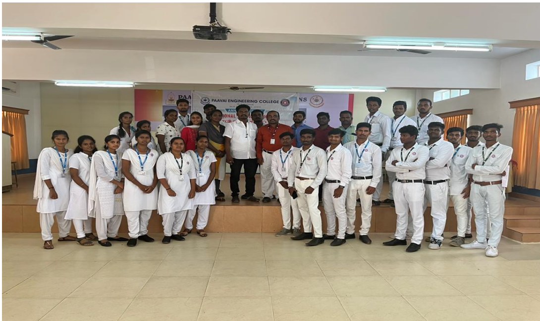
Group Photo of our Volunteers Blood Donation (22.09.2022)