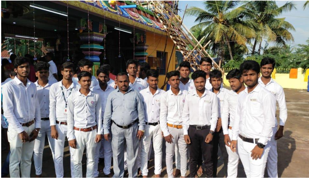
Our Volunteers providing volunteer ship for Lakapuram Mari Amman Kovil Kumbhabhishekam (29.08.2022)

Paavai Engineering College NSS provided NSS volunteer ship for Lakapuram Mari Amman Kovil Kumbhabhishekam on 29.08.2022 (Monday) at Lakapuram, Namakkal. Our NSS volunteers involved in the food committee, making the crowd properly visiting the Mari Amman temple. In this activity 25 volunteers were participated.