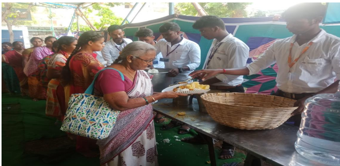
Our Volunteers providing volunteer ship for Janmasthanmi at ISKCON, Salem (18.08.2022)

Paavai Engineering College NSS Volunteers helped and supported various functions organized in the Krishna Jayanthi- Janmasthanmi, ISKCON, Salem on 18.08.2022 (Thursday). Our students involved in the food committee, making arrangements to visiting the Lord Krishna temple. In this activity 20 volunteers were participated.