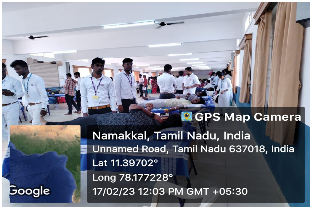
Our Volunteers and Students Donating their Blood (17.02.2023)