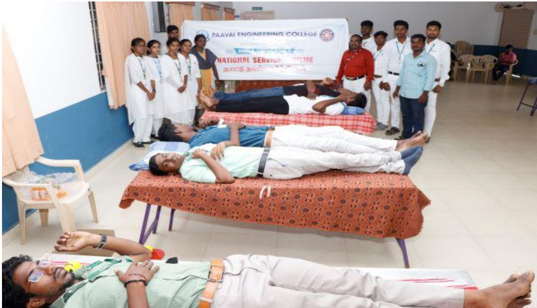
Our Volunteers and Students Donating their Blood (22.09.2022)