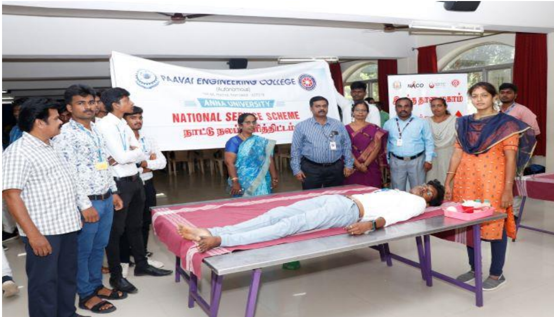
Our volunteers and students donating blood in the camp (11.08.22)