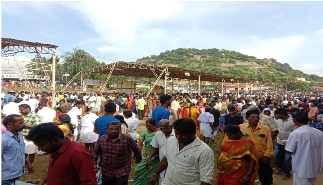
Our Volunteers providing volunteer ship for Atthanoor Amman Kovil Kumbhasheikam (11.09.2022 to 12.09.2022)