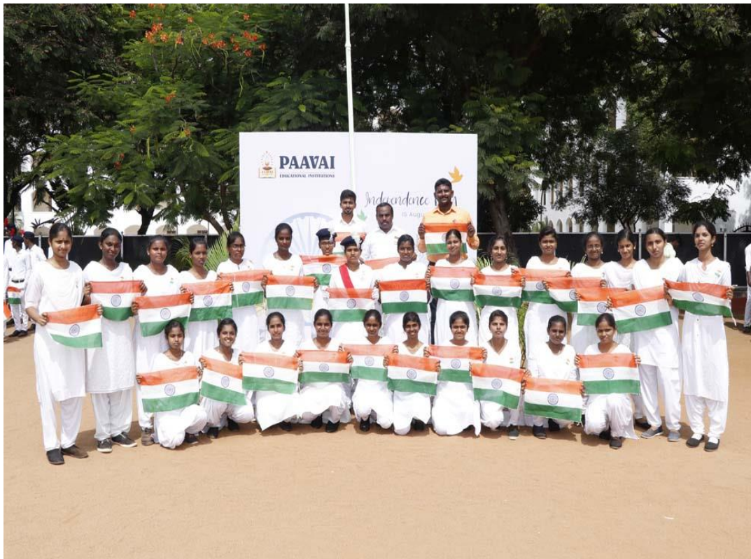
Independence Day Celebration Group Photo (15.08.2022)