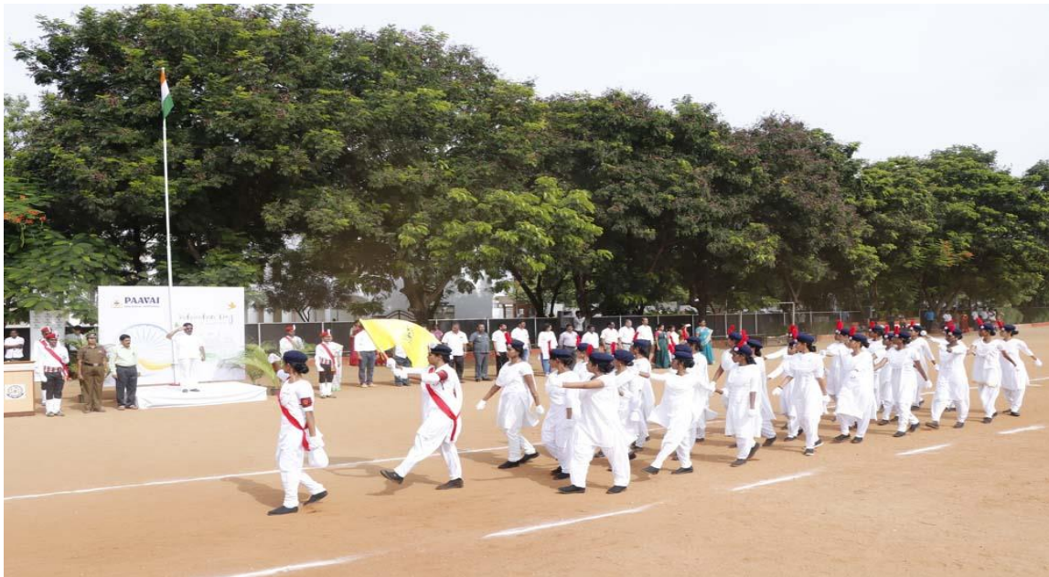
Our NSS volunteers participating in the march past in the Independence Day Celebration (15.08.2022)