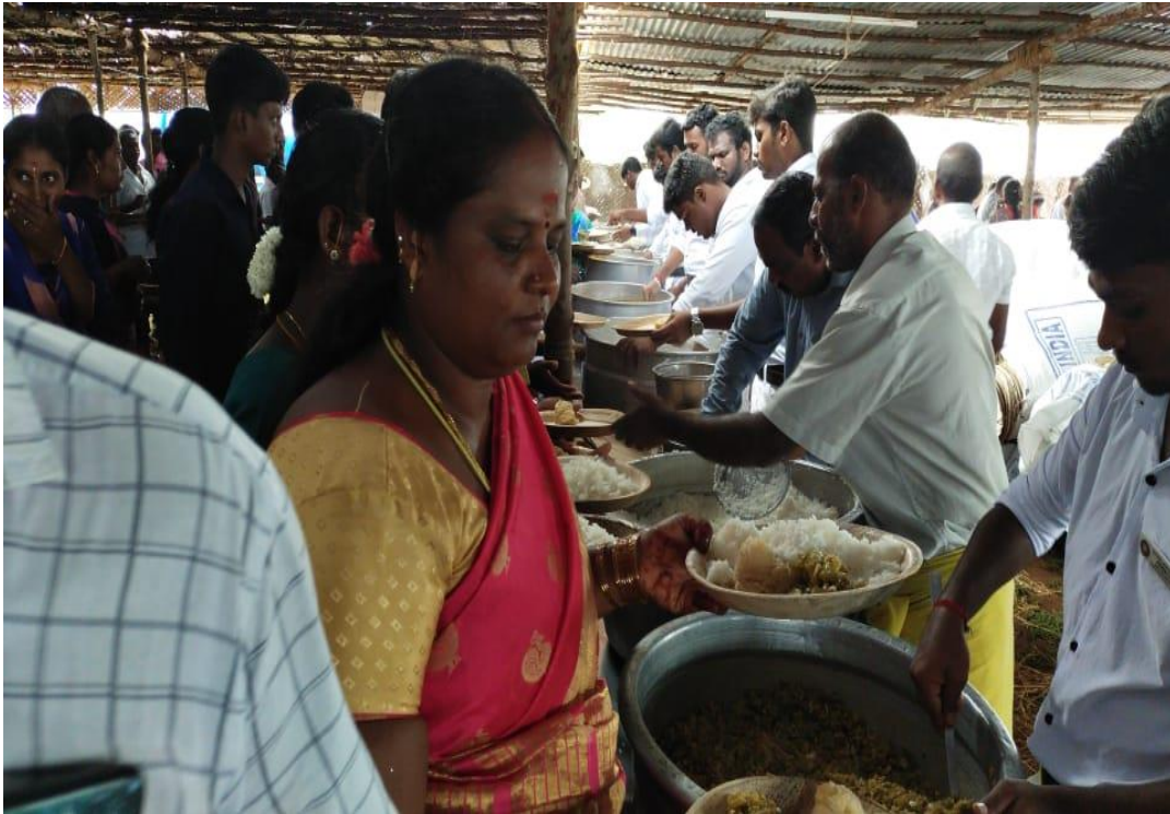
Our Volunteers providing volunteer ship for Lakapuram Mari Amman Kovil Kumbhabhishekam (29.08.2022)